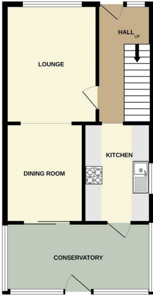
GROUND FLOOR 490 sq.ft. (45.5 sq.m.) approx.